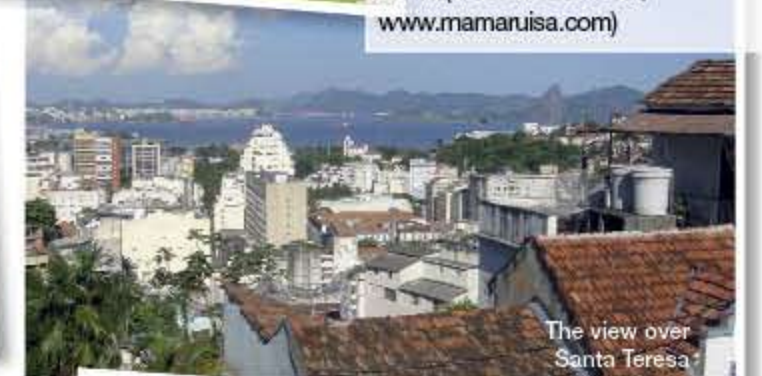
The view over Santa Teresa