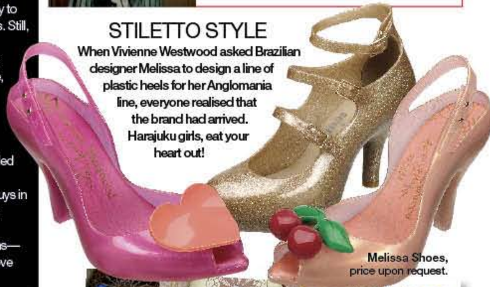
Melissa Shoes, price upon request.

When Vivienne Westwood asked Brazilian designer Melissa to design a line of plastic heels for her Anglomania line, everyone realised that the brand had arrived. Harajuku girls, eat your heart out!