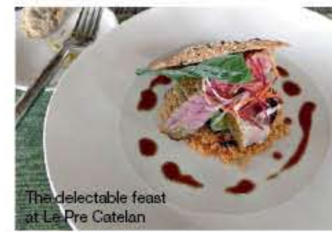
The delectable feast at Le Pre Catelan