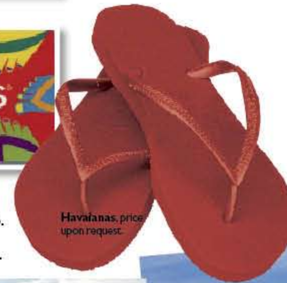
Havaianas, price upon request.

The uniform dress shoe of fashionistas and locals alike. No ensemble is complete without the iconic Havaiana.